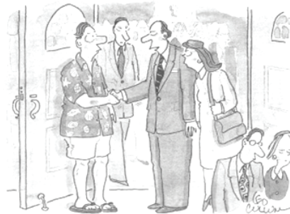
"Loved the sermon. Hated casual Sunday."